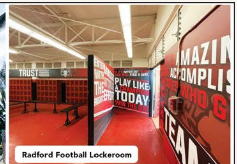
Radford Football Lockerroom