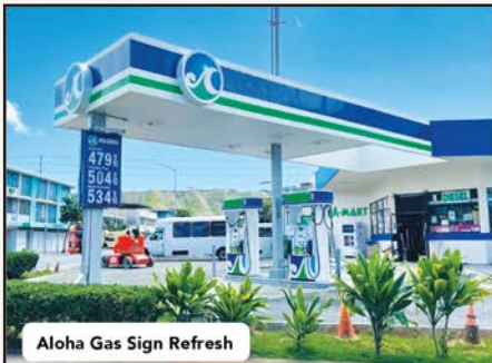
Aloha Gas Sign Refresh