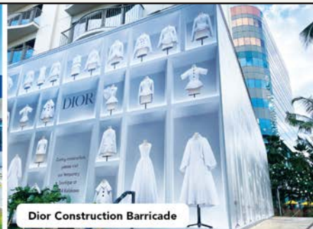
Dior Construction Barricade