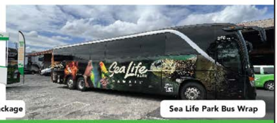
Sea Life Park Bus Wrap