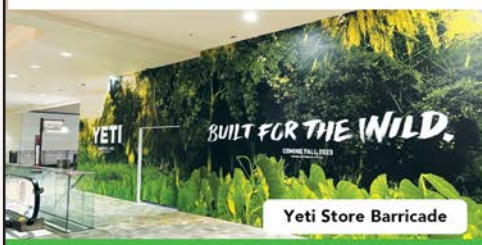
Yeti Store Barricade

Barricades Walls and Windows Fleet Graphics Structure Graphics