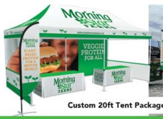
Custom 20ft Tent Package